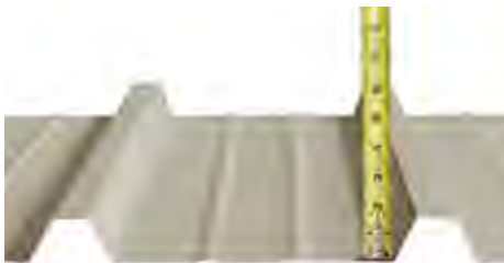
The Butlerib II wall panels feature a 1½" corrugation for additional strength.

Butlerib II wall panels feature a full 1½-inch-deep corrugation for a clean, simple appearance and added strength. The panels are also available in a variety of material thicknesses, enabling you to balance the building's performance requirements with budgetary constraints.