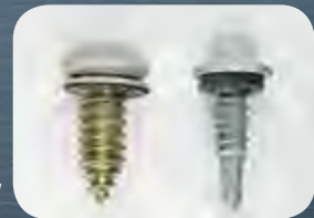
Butler Scrubolt Others

The Butler Scrubolt™ can be specified for panel-to-structural connections vs. industry standard fasteners.