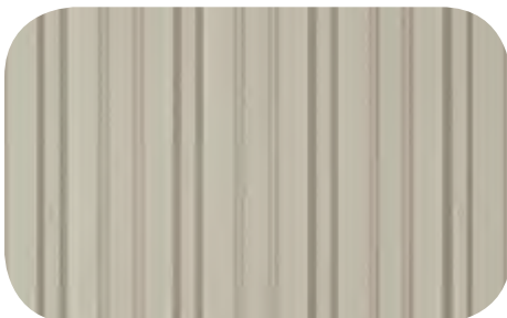
The Butlerib II wall panels are 3 feet wide and up to 40 feet in length, so wall installation can be completed quickly—even on large buildings.

Each Butlerib II wall system panel and supporting structure is available factory punched to assure precision and speed in the installation process.